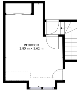
TOTAL: 47 m 2 Below Ground: 14.4 m 2 - FIGURE 2: 15 m 2 EXCLUDED: REAR PORCH: 1.5 m 2 - TOTAL: 31 m 2