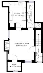
TOTAL: 47 m 2 Below Ground: 14.4 m 2 - FIGURE 2: 15 m 2 EXCLUDED: REAR PORCH: 1.5 m 2 - TOTAL: 31 m 2